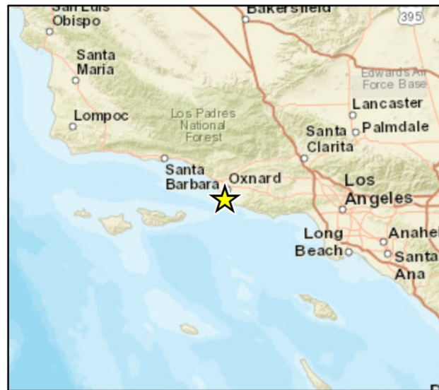
Fig 1 Regional Location