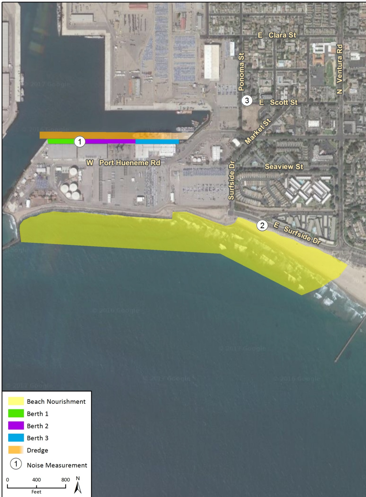
Figure 3 Noise Measurement and Sensitive Receptor Locations