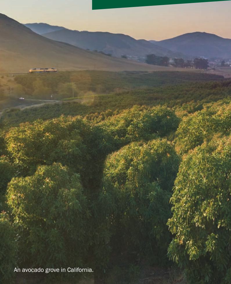
An avocado grove in California.