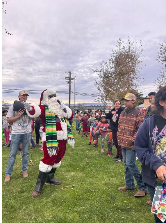
Santa Claus welcoming community members to the Nyeland Acres Posada