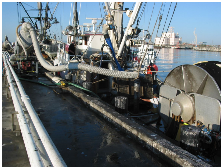
Squid operations located at the Port of Hueneme.