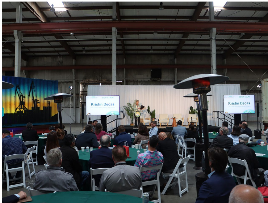
12th World Trade Month Event hosted at the Port of Hueneme

[Port Hueneme, CA] –President Franklin Roosevelt established World Trade Week in 1935 to recognize the importance and benefits of global trade to the local and national economy. This year, the Port of Hueneme welcomed trade partners from around the world with a focus on “Resiliency – A Path Forward” that included participation from The Department of Commerce officials, local elected officials, business leaders and consuls who shared information focused on the current state of the supply chain, the economy, and global trade.