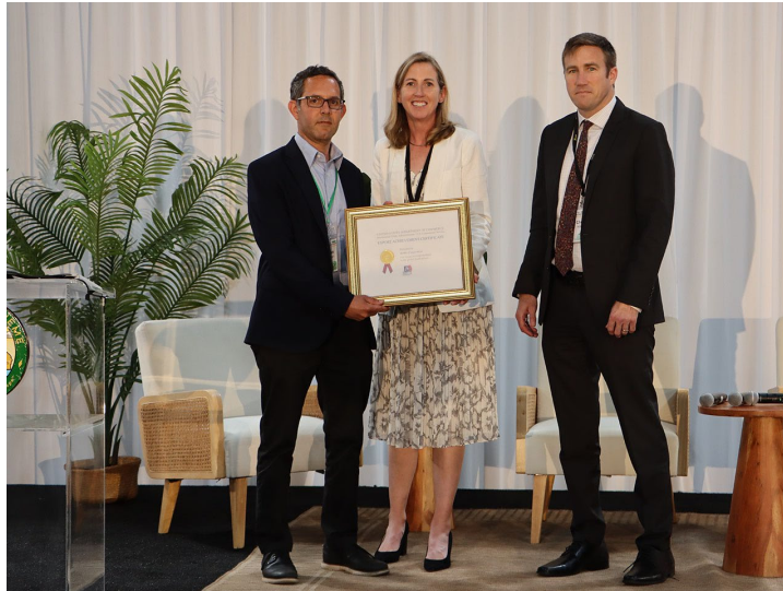
US Commercial Service Export Achievement Award presented to Bardex Corporation by the US Commercial Service.